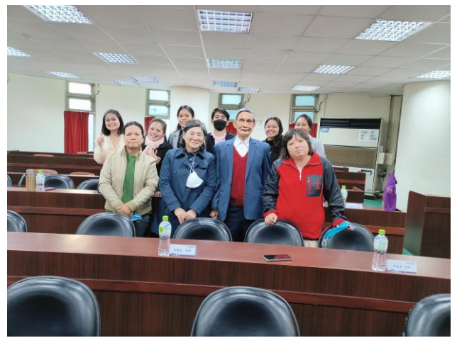
SEMINAR ON IFOAM AT MINGDAO UNIVERSITY