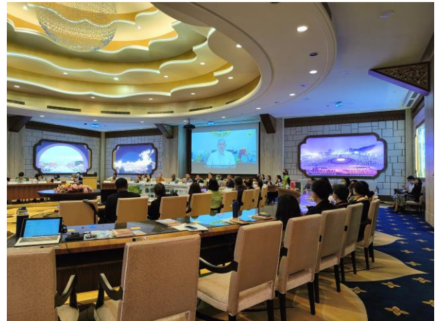
7 TH SUSTAINABLE DEVELOPMENT & GREEN TECHNOLOGY INTERNATIONAL SYMPOSIUM