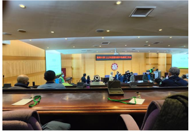
WORKSHOPS TOWARDS CARBON NEUTRAL AGRICULTURE