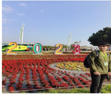
ORCHID EXHIBIT AT CHANGUA