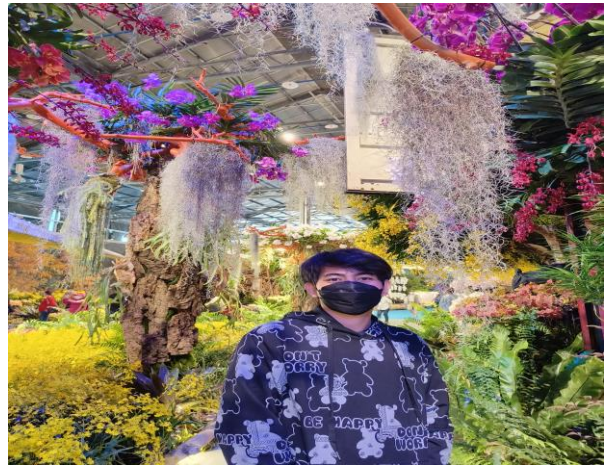
ORCHID EXHIBIT AT TAINAN