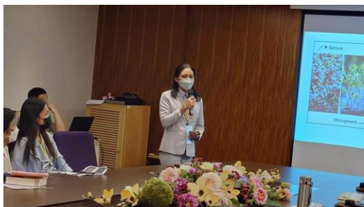
(During my presentation of my study entitled "Use of different growing media on the growth and production of microgreens: A Comparative Study".)

The 2023 7th Sustainable Development and Green Technology International Symposium was amazing. For me, this conference is the highlight of my time studying at Nanhua University as a TEEP student. Delegates coming from different parts of the world are present, and some of them presented topics that gave us insight and knowledge. I've presented my research entitled "Use of different growing media on the growth and production of microgreens: A Comparative Study". I am very grateful to be part of this conference, for I am able to share and gain knowledge from my fellow participants.