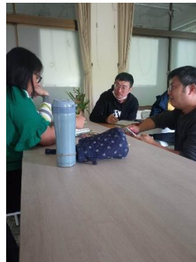
(During classroom discussion.)