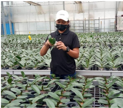
(Placing the excess roots inside the pot)