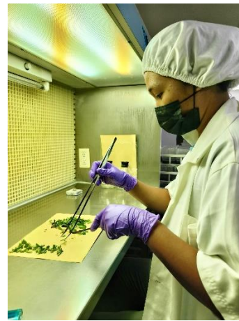
(During tissue culture of orchids)