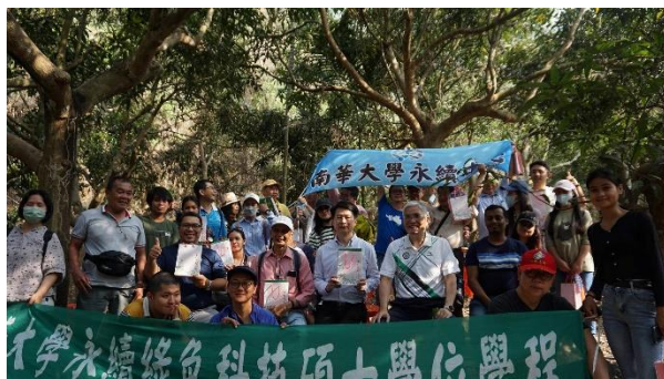
(After the Tour and short discussion at Maolin Butterfly Valley)

Purple Butterfly Valley is located in Maolin; we visited the place where you can see beautiful butterflies during the winter season. We are not able to see butterflies there because they have migrated to another place, but I can say that the place is beautiful and peaceful.