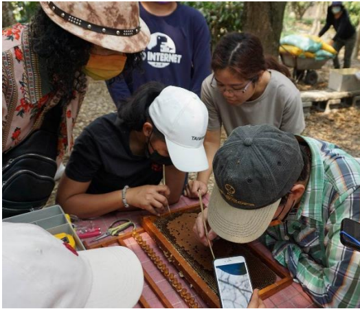
(During the selection of larva for queen bee)