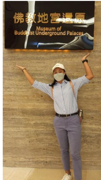
(Enjoying every part of Fo Guang Shan)