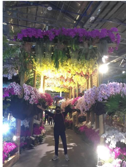
(Experiencing Taiwan International Orchids Show)