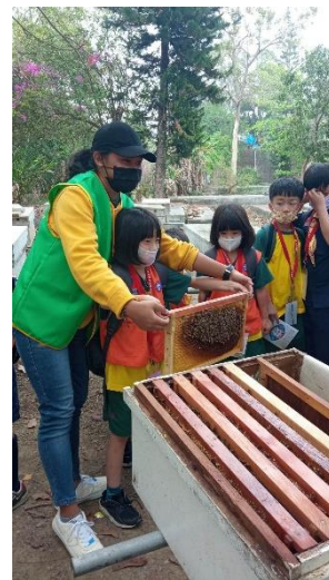
(Assisting on holding the bee frames while taking a photo)