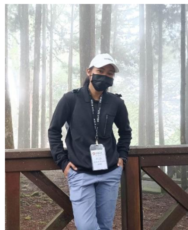
(Enjoying fog at the mountain of Alishan)