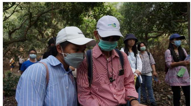
(Professor explaining to me about butterflies)