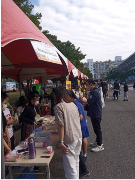
(During the Cultural Festival selling Filipino Food)