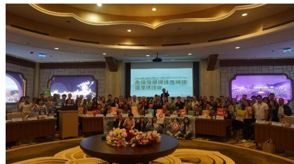
(Photo taken after the conference together with all the delegates came from different part of the world.)