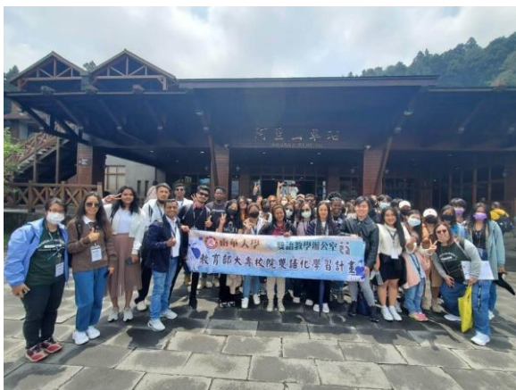
(Together with other International Students)

The trip to Alishan was my last trip as a TEEP student in Taiwan. It's because I love nature that I really love and enjoy the place. It was so relaxing and peaceful. We walk around the rainforest, where you can see animals living freely and century-old trees that are conserved and protected.