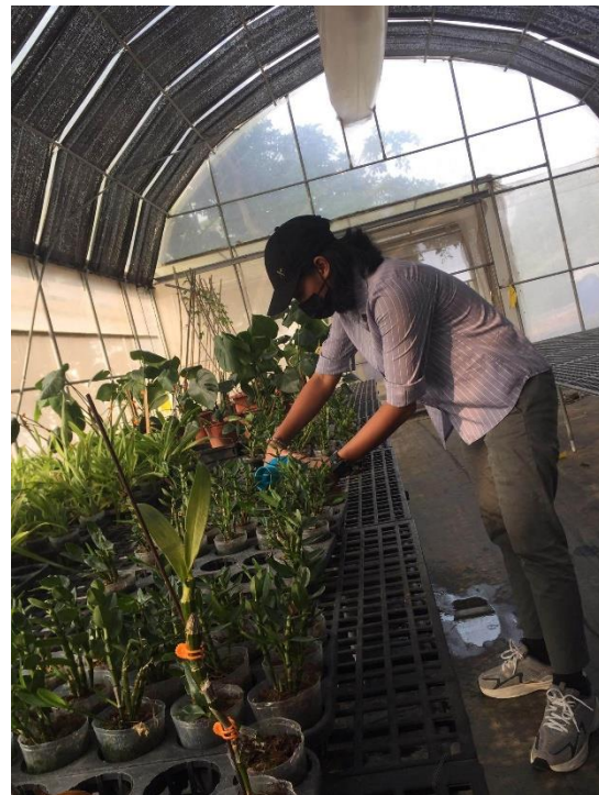
(Watering the Dendrobium.)