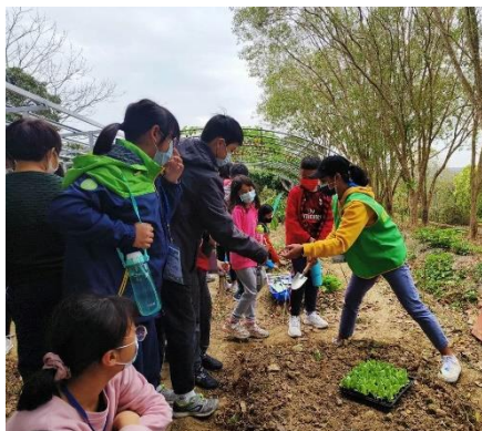
(Facilitating during outside activity – planting Lettuce)

During winter camp, I learned so many things. Familiarizing children who have different speaking languages than me is challenging for me, but it's not a hindrance as I communicate with the children that are assigned to me, which is not that difficult to handle. I vividly remember how happy I am, even if it's tiring, but seeing those children enjoy my company makes my heart so happy. During different discussions and outdoor activities, they are very participatory. I am so happy to be part of that activity, for they learned things from me that I also learned from them.