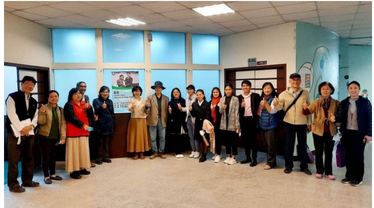
(After the event together with other participants.)