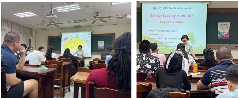
(Photos taken during the seminar entitled "Gender Equality at Work".)