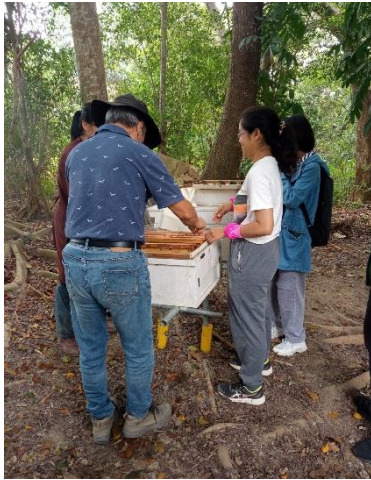
(Professor showing the bees.)