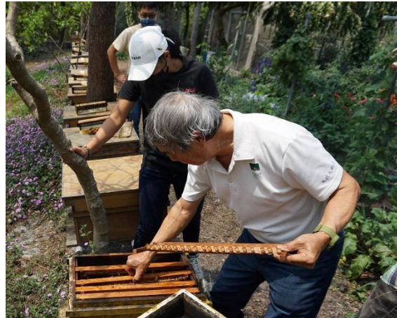
(Placing the frame with artificial queen cell contain of larvae to the bee hive breed new queen bee)