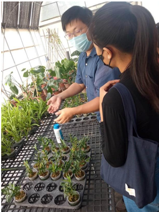
(Professor discussing about Dendrobium.)