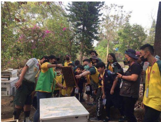
(During my discussion about bees)

During this time, I was assigned to the bee farm to introduce the bees to the scouts. It was a good experience for me, especially every time I saw the scouts listening to my explanation and asking questions. I am very happy for the opportunity given to me, for I have the chance to share my learnings about bees with others.