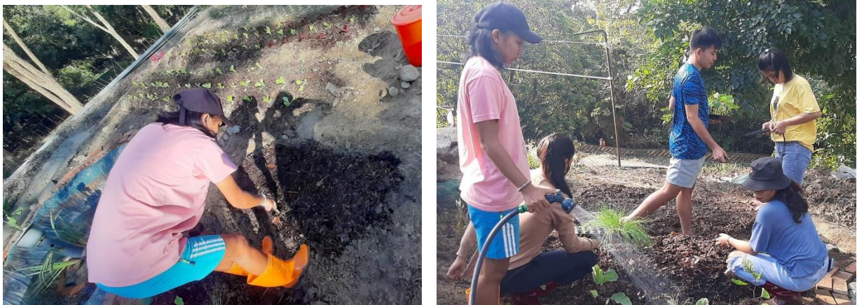
(Land preparation and transplanting of crops)

Nanhua Permaculture Farm is a place where we stayed most of the time for six months. In this position, I can say that I really applied my learning in agriculture. I also experienced different kinds of work while staying in this place, from easy to difficult. Working on the farm helps me enhance my capabilities and discover things about myself.