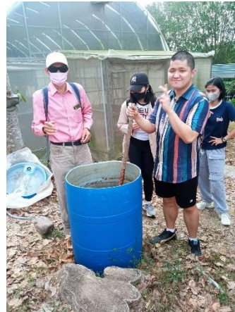
(Professor is discussing about KKF and letting us mixed the KKF)