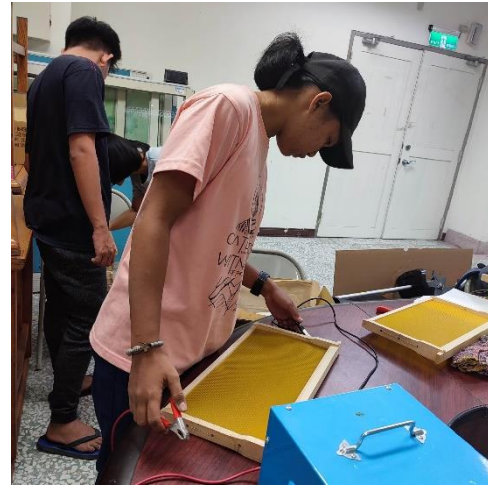
(making bee frames.)